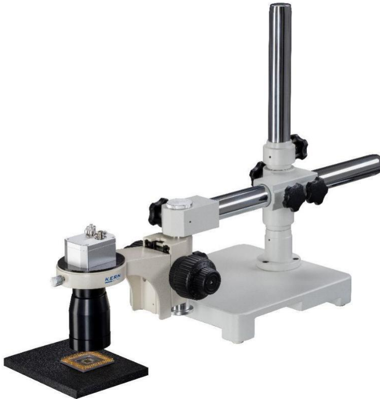
Picture 3: Microscope stand with holder and PI adjustment with PI camera