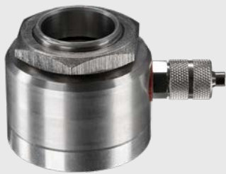
ACCTAPMH Air purge collar CTratio