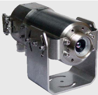
ACCTLCJ CoolingJacket (stainless steel) for CSLaser/ CTlaser/ CSvideo/ CTvideo