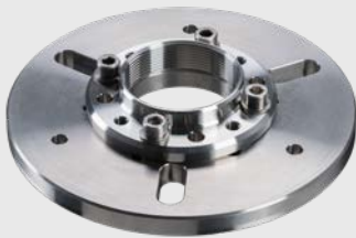
ACHAMA Mounting adapter: Mounting and pipe flange