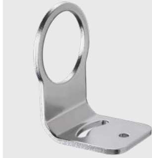
ACCTLFB Mounting bracket, adjustable in one axis